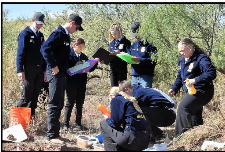
Students study the soil characteristics at the soils pit.