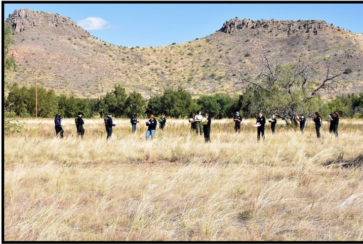
Students at the first ever Forestry competition. It was a great addition to the 2023 Riggs Field Day!