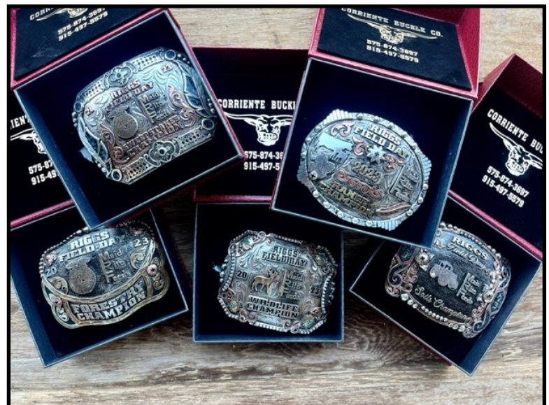
Beautiful buckles sponsored by Maid Rite Feeds!