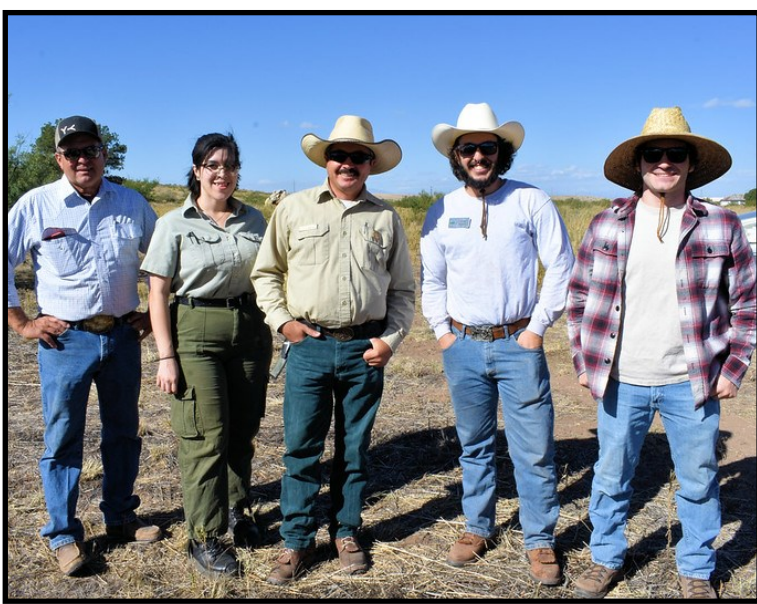
Volunteers from the US Forest Service and NRCS enjoy the weather at the 2023 Riggs Field Day.