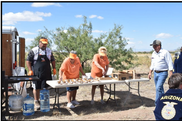
A delicious lunch was served by Andy's BBQ.