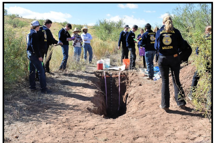
Students at the Soils Pit.