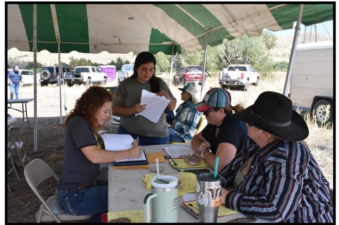
Scores being tallied under the tent.