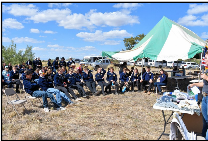
Students wait for results at the 2023 Riggs Field Day.